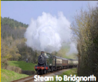
Steam to Bridgnorth