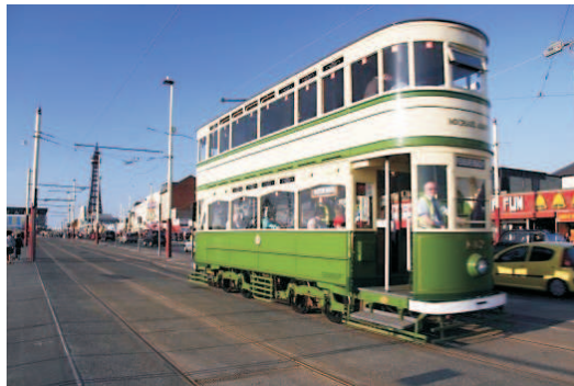
One of Blackpool's famous Vintage Trams

The Tower Ballroom, Blackpool, made famous by BBC's 'Strictly Come Dancing'